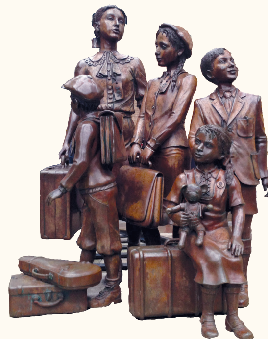
Kindertransport Memorial, Liverpool